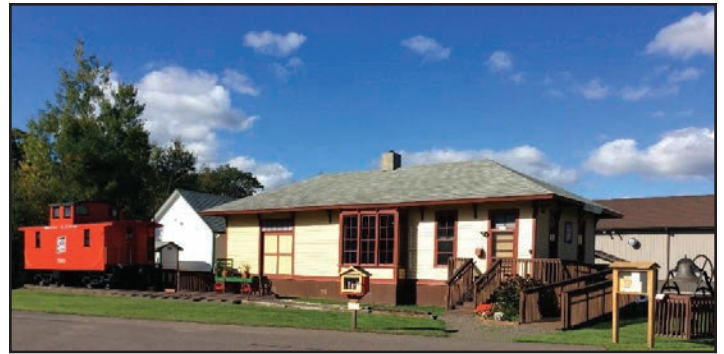
The Stone Lake Depot/Museum, 1913 Soo Line Caboose, 1926 Town Hall, and Little Free Library