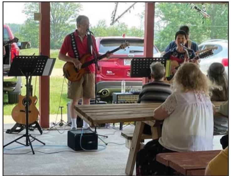
Good Medicine Band