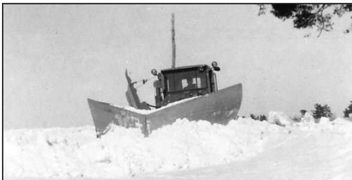
First grader used in the Town of Sand Lake