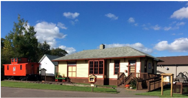
The Stone Lake Depot/Museum, 1913 Soo Line Caboose, 1926 Town Hall, and Little Free Library

Stone Lake Area Historical Society Digitization Project Website: http://recollectionwisconsin.org