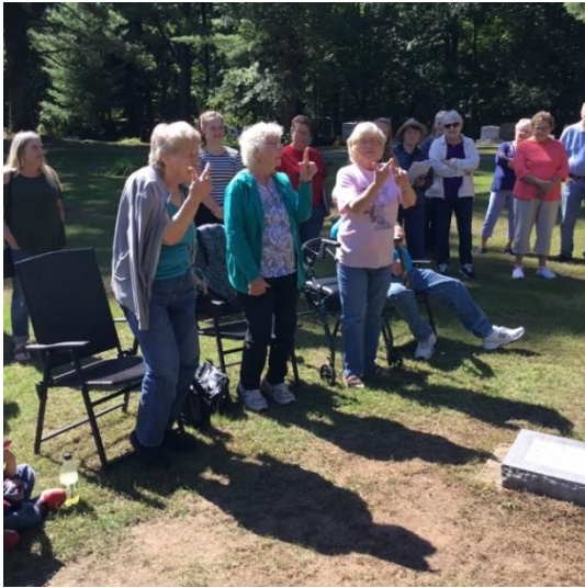
These folks are the Lindell grandchildren who are shown counting their fingers in Swedish, as they were taught by Grandpa Lindell

the museum! We also need to thank all of you who bought a glass of wine!