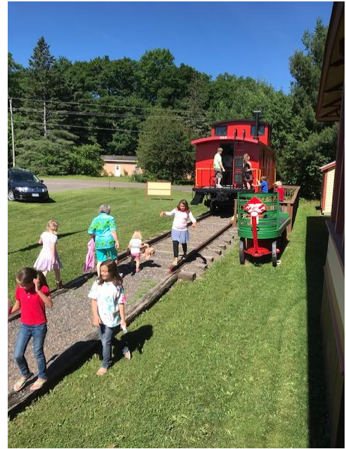
The children's favorite exhibit when they visit the museum is the caboose...inside and out