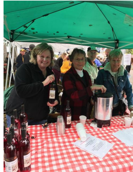
These happy volunteers manned the "Wine by the Glass" booth during the 2018 Cranberry Fest along with many other faithful volunteers! Thanks, everyone!

the museum! We also need to thank all of you who bought a glass of wine!