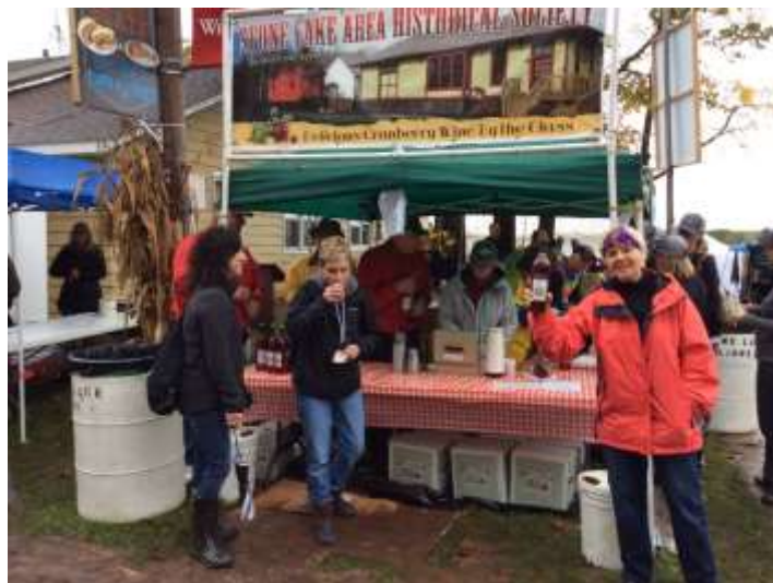
The 2017, Cranberry Fest "Wine by the Glass" Booth