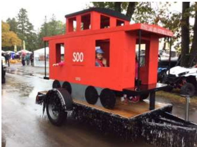
2017 Cranberry Fest Caboose...Ariana Slayton waving out the window