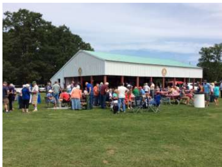
The crowd of over 200 people at the August, 2017, Stone Lake Family Reunion Picnic

Stone Lake's first Family Reunion Picnic held on August 5, 2017, was a huge success. Visitors from everywhere were found returning to the home of their childhood where they enjoyed refreshments, music, and many shared memories. Past Boylan School students made this day even more special by holding their own Boylan Reunion at this event. If and when this special Family Reunion Picnic is held again, it is hoped that other historic schools will plan their reunions as part of the event. Watch the newsletters for news of future events.