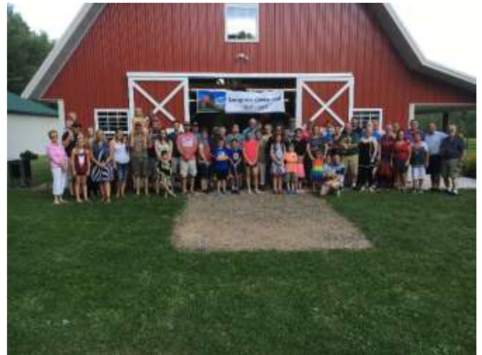
Langham Centennial Family Reunion – August, 2017

from Oak Park, Illinois. Attended by about 60 Langham descendants and spouses, lots of history was shared, including photos from as far back as 1900. Some of the special historical elements included posters of each member of the “founding family” with their bio and photos from throughout their lives (now on display at the Stone Lake Area Historical Society Museum); a wonderful photo montage video set to music; a presentation on the history of the farm, a trivia contest, interesting “then and now” facts, a selection of historical photos, and creative displays of family photos. In preparation for the Centennial celebration, many relatives were interviewed regarding family and farm history and memories of the Hauer/Stone Lake area. Ancestry.com was used to create a Langham family tree.