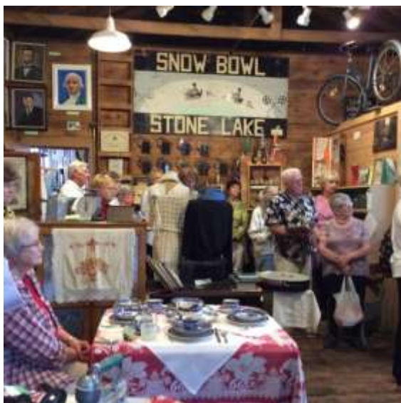
Greeters enjoying the museum and each other’s company during “Night at the Museum” 2017