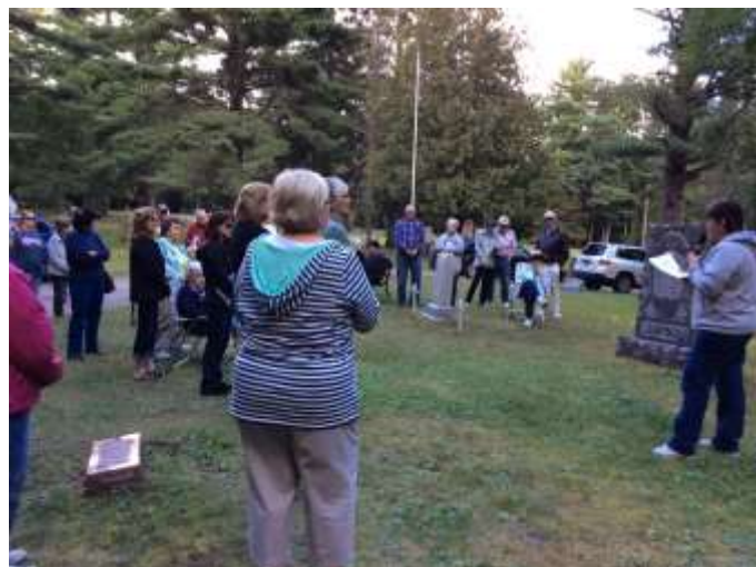
A previous Cemetery Walk event

Please join us for the fifth annual Evergreen Cemetery Walk on Saturday, September 8, 2018, from 1:00 PM to 3:00 PM. We will highlight a number of local families and have wonderful music, refreshments, and gravestone rubbing instruction. This is a nice way to spend a fall afternoon!