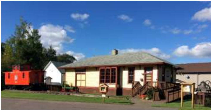
The Stone Lake Depot/Museum, 1913 Soo Line Caboose, 1926 Town Hall, and Little Free Library

Stone Lake Area Historical Society Digitization Project Website: http://recollectionwisconsin.org