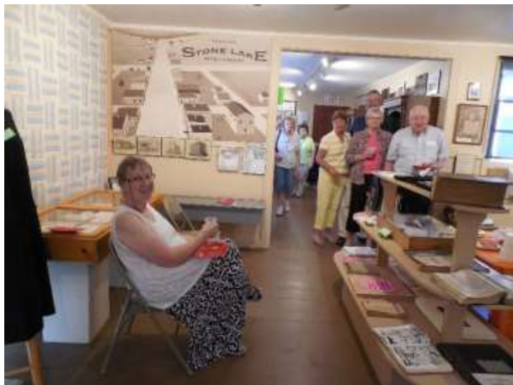
Greeters enjoying the museum and each other's company at a recent Docent Appreciation event