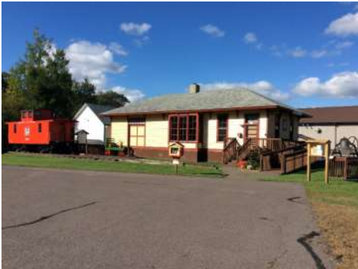
The Stone Lake Depot/Museum, 1913 Soo Line Caboose, 1926 Town Hall, and Little Free Library

Stone Lake Area Historical Society Digitization Project Website: http://recollectionwisconsin.org