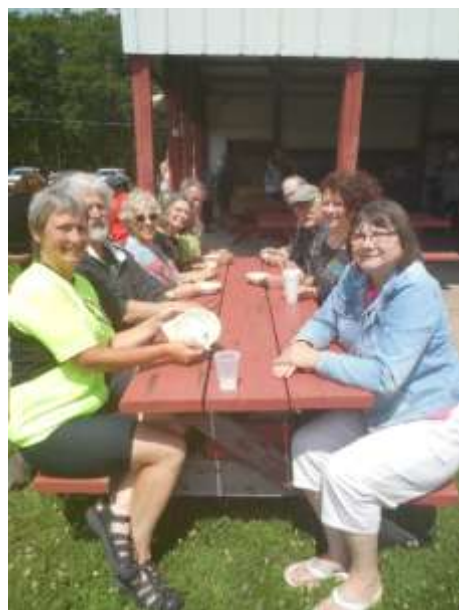
A group of good friends enjoying the Pie and Ice Cream Social.

Please reserve Sunday, July 9, 2017, from 1:00 PM to 3:00 PM for the annual Stone Lake Area Historical Society Pie and Ice Cream Social! Delicious homemade pies will be served with ice cream and coffee. Ice cream cones will also be available. Please join us at the Stone Lake Lions Park for an afternoon of music and visiting with friends!