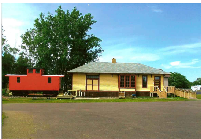
THE STONE LAKE DEPOT/MUSEUM