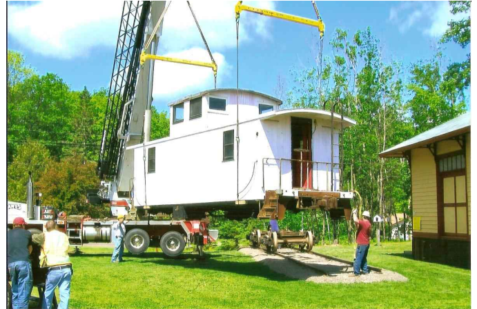
Caboose No. 593 finds its new home at the Stone Lake Area Historical Society's depot/museum

the other holding the caboose body, and the 70 ton crane do their job, setting their cargo on the rail line in front of the depot. Everyone is invited to come see the caboose whenever they are in the area and volunteers are at work.