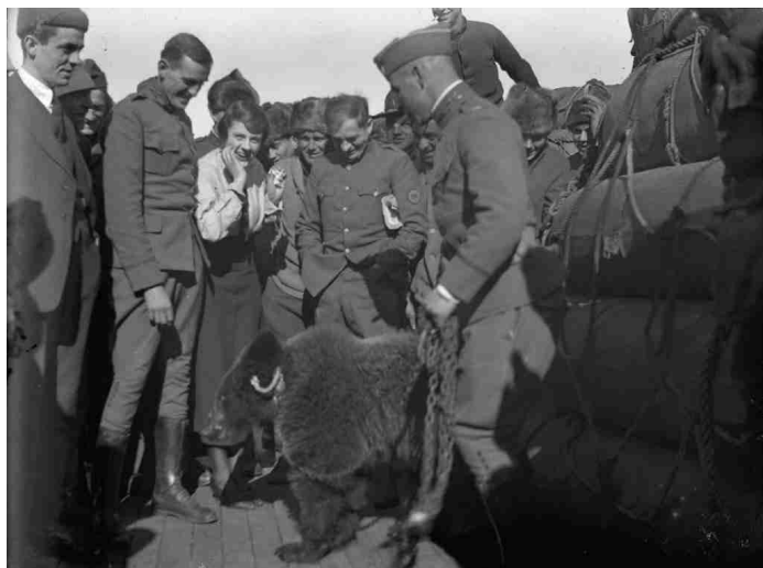
Soldiers and civilians are shown above admiring the Division's bear mascot