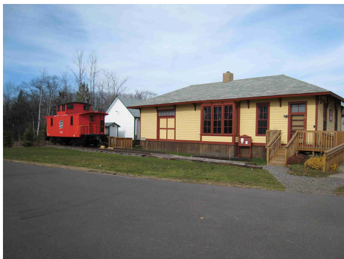
THE STONE LAKE DEPOT/MUSEUM, SOO LINE CABOOSE, AND 1926 TOWN HALL