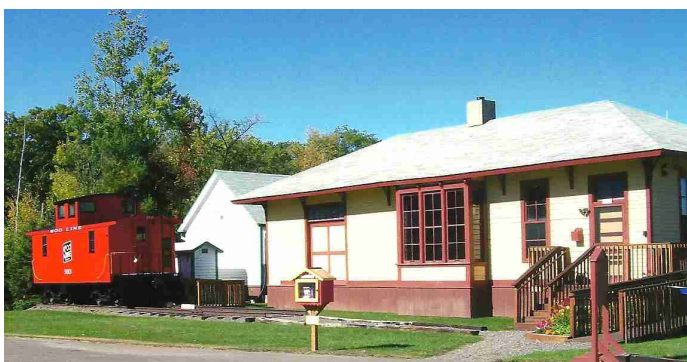
THE STONE LAKE DEPOT/MUSEUM, 1913 SOO LINE CABOOSE, 1926 TOWN HALL AND LITTLE FREE LIBRARY

Stone Lake Area Historical Society Digitization Project Website: http://recollectionwisconsin.org