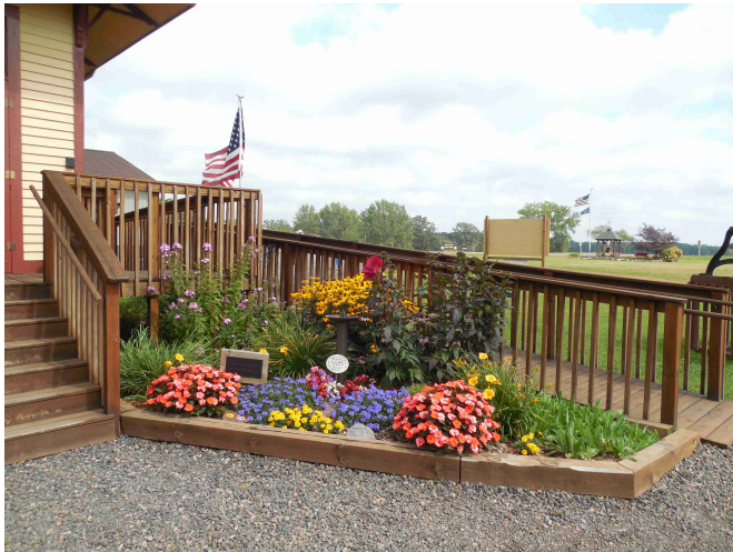
STONE LAKE GARDEN CLUB FLOWERS AT MUSEUM ENTRANCE

Those of you who visited the museum this season were treated to a beautiful display of flowers that seemed to change every time you saw them. The garden is never the same from May to October. Dedicated members of the Stone Lake Garden Club water and remove weeds, deadhead and re-plant so that this garden is always full of wonderful surprises. A big THANK YOU to everyone who cares for this special garden!