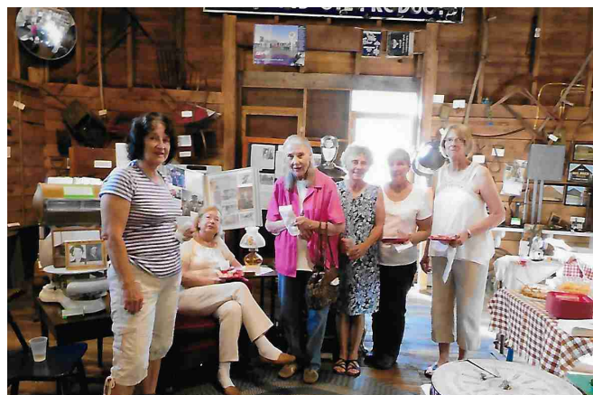
ABOVE & BELOW: Docents and volunteers are seen enjoying refreshments and conversation with other docents and volunteers at their special Appreciation Event

The museum had a record-setting season in 2015! We had more than 1,000 visitors tour the museum! We are very excited about this and very lucky that we have the terrific team of docents we have. These docents make it possible for us to handle this number of visitors. Did you know that each year we have over 200 visitors at the museum on ONE day...the Saturday of our Cranberry Festival in early October. Our Docent & Volunteer Appreciation Evening is Thursday, September 8, 2016, from 5:00 PM to 7:00 PM at the museum.